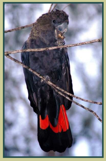
Glossy Black-Cockatoo

Drooping Sheoak Cones