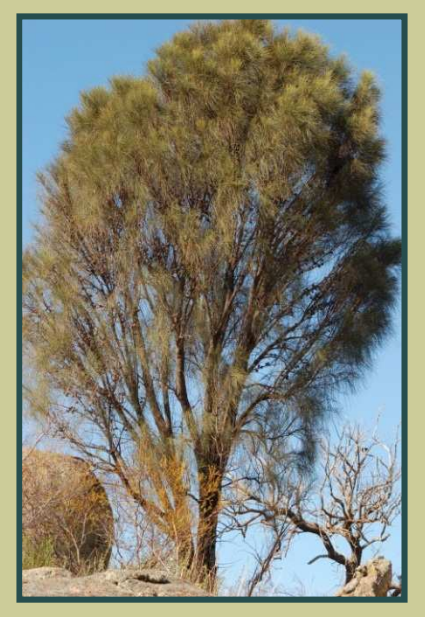
Drooping Sheoak: Greening Australia