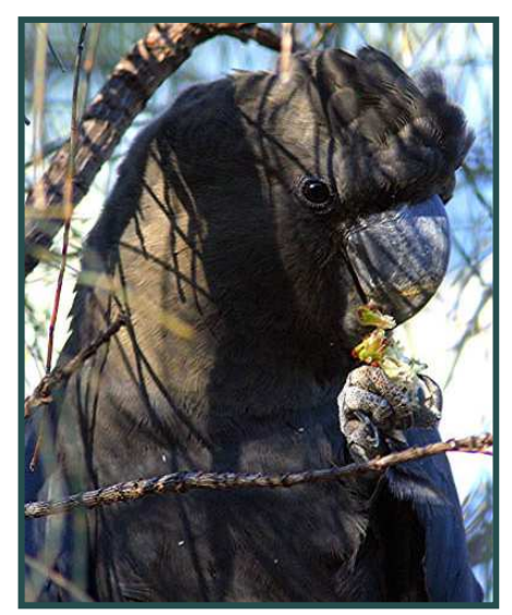
Glossy Black-Cockatoo: Geoffrey Dabb

The Glossy Black-Cockatoo is listed as vulnerable in NSW and the ACT. A number of factors have contributed to its vulnerability, including historical land clearing, ongoing loss of hollow-bearing trees, urbanisation and over-grazing. Its vulnerability is also related to its specialist feeding habits: it feeds exclusively on Sheoak species, which are particularly susceptible to browsing and lack of recruitment from inappropriate grazing. The Glossy Black-Cockatoo's main source of food in our region is the Drooping Sheoak.