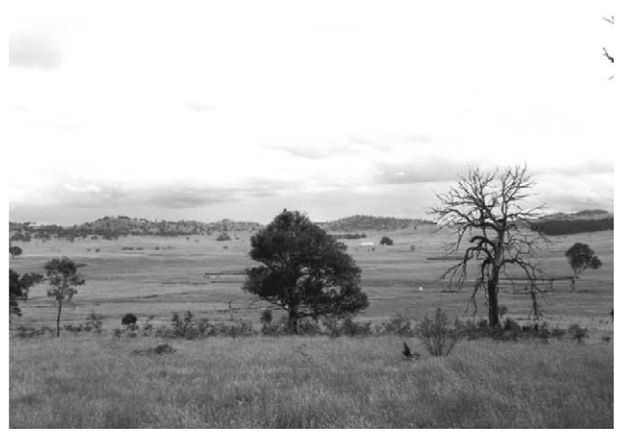
Fig. 3 – Micro-restoration is where tree regeneration is facilitated in the immediate vicinity (<30 m radius) of an existing scattered tree. These examples, from south-eastern Australia, show what micro-restoration might look like.

tered trees (Lindenmayer et al., 2005; Fig. 3). Methods for micro-restoration will be locally specific, and dependent on the specific mechanisms involved in the regeneration of particular tree species. However, methods might include encouragement of regeneration by placing small temporary fences around individual mature trees or groups of trees to exclude grazing, direct planting and seeding, soil scarifying or burning beneath existing trees. Notably, micro-restoration could be useful in complementing existing restoration programs which aim to establish large and consolidated patches of native vegetation (Bennett et al., 2000). Other management strategies might include reduced stocking rates or alternative grazing regimes (Jansen and Robertson, 2001; Spooner et al., 2002).