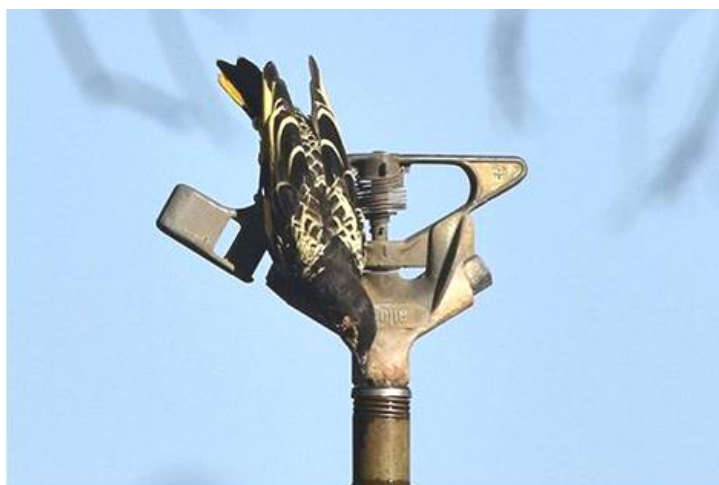
Juvenile Eastern Koel (top) Regent Honeyeater (above)