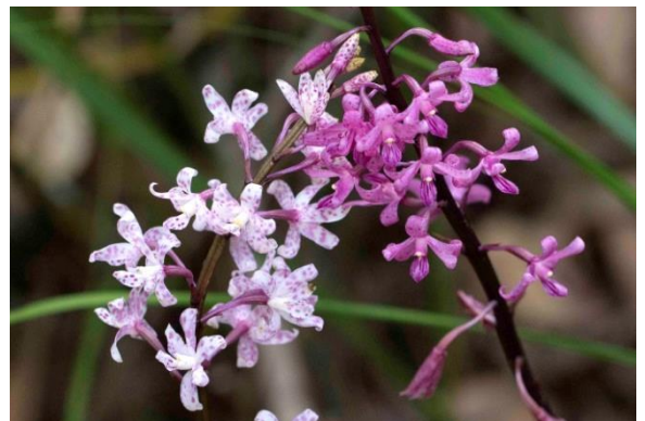
Photos Piccaninnie Ponds (top right), gannet colony (above left), Hyacinth Orchids (Spotted left, Rose right) above

Our accommodation was at the Baptist Church Camp at Allerstree east of Portland. It is now privately owned but still run on the same lines. The advantages of staying there was that one could just walk across the road and down onto the beach. Great for photographing the numerous coloured seaweeds that get washed up. It is easy to reach three National Parks, Mt Richmond, Lower Glenelg, and Cobboboonee, with Mt Eccles not too far away for a change of scenery. As the excellent company of the VNPG, the interesting evening talks, not to mention the abundant photography tips freely discussed, we had a terrific week on the coast.